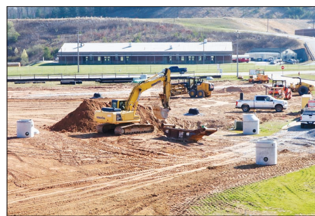
The county is currently grading the future site of the new double rec gym to be located next to

with Enotah CASA, we are a nonprofit organization," said D'Angelo. "We're part of a nationwide network whose mission is to be able to recruit, screen and train volunteers who along the lines of the Byron are called Court-Appointed