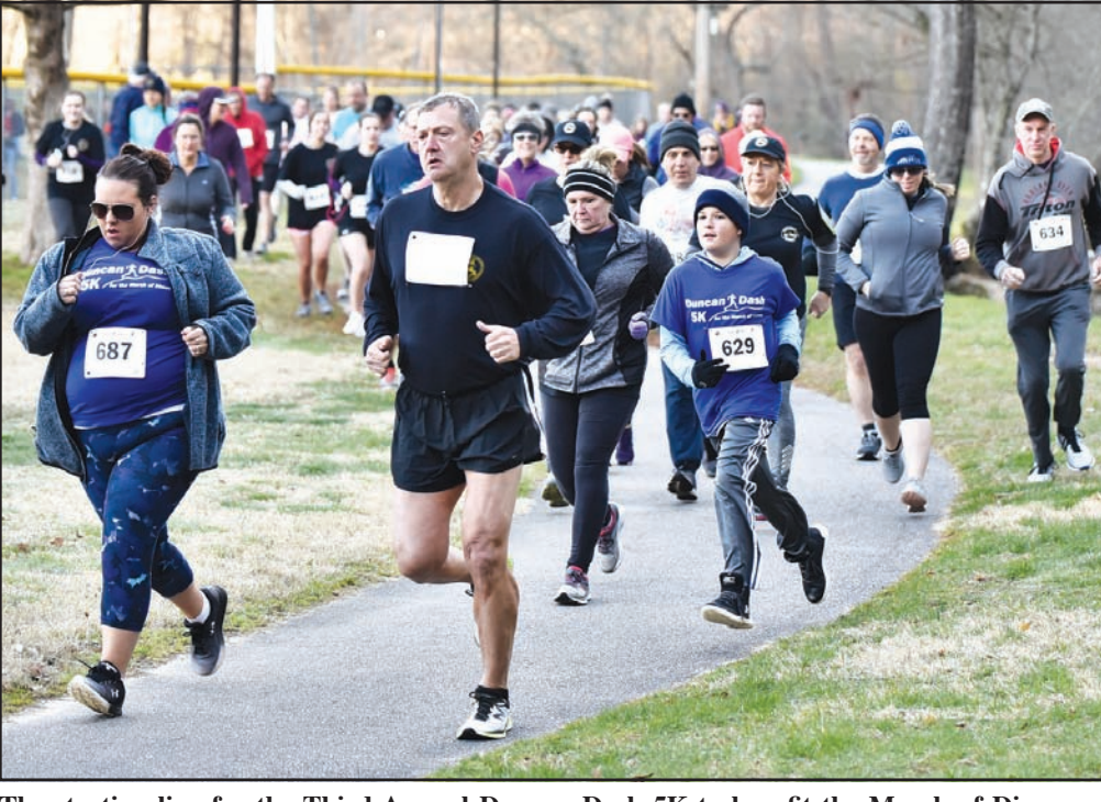
The starting line for the Third Annual Duncan Dash 5K to benefit the March of Dimes on Saturday, March 23, at Meeks Park